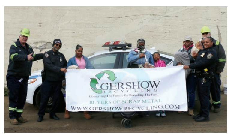
NYPD's 73rd Precinct