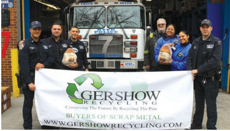
NYPD's Emergency Service Unit