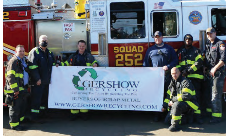
FDNY Rescue Squad 252.