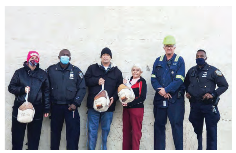
NYPD 73rd Precinct.