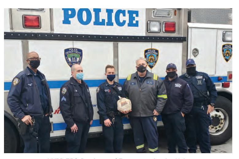
NYPD 75th Precinct and Emergency Service Unit.