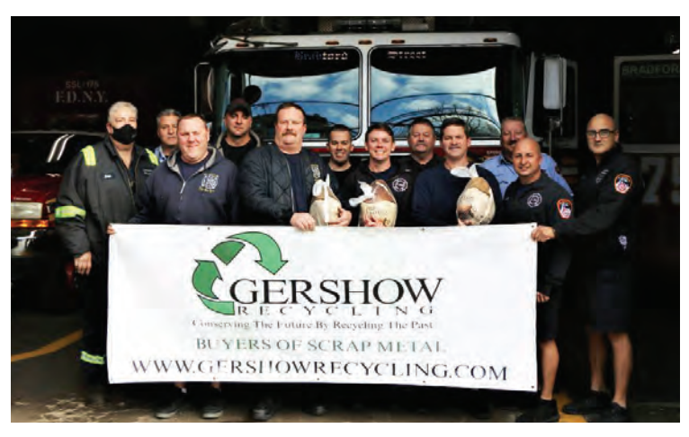
FDNY Engine 332/Ladder 175 at Bradford Street.

Last November, in celebration of Thanksgiving, Gershow's Brooklyn location purchased turkeys to donate as a community service. First responders then distributed the turkeys to local families in need. Pictured below are the police and fire department units that participated.