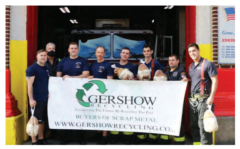
FDNY Engine 290/Ladder 103 "Pride of Sheffield Avenue."