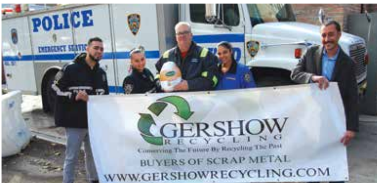
NYPD 75th Precinct.