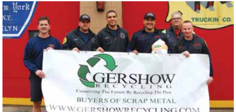
FDNY Engine 332/Ladder 175.