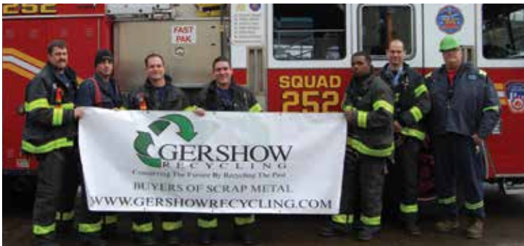
FDNY Rescue Squad 252.