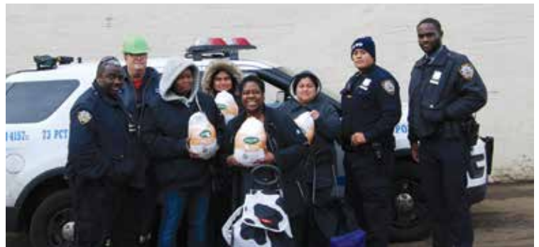
NYPD 73rd Precinct and P.S. 284.