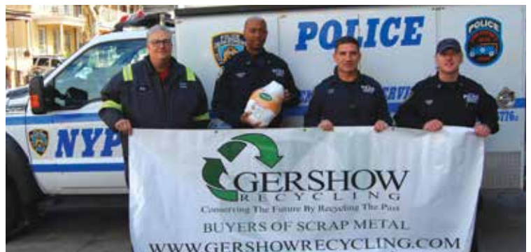
NYPD Emergency Services Unit.