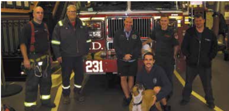
FDNY Engine 231/Ladder 120 at Watkins Avenue.