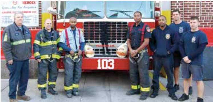
FDNY's Ladder 103 – "Pride of Sheffield Avenue."