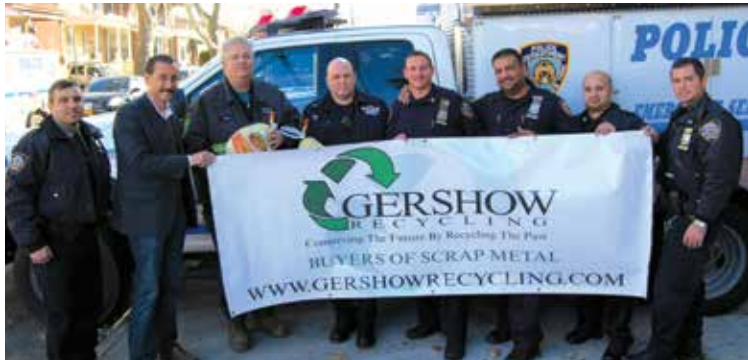
NYPD's 75th Precinct and NYPD's Emergency Services Unit.