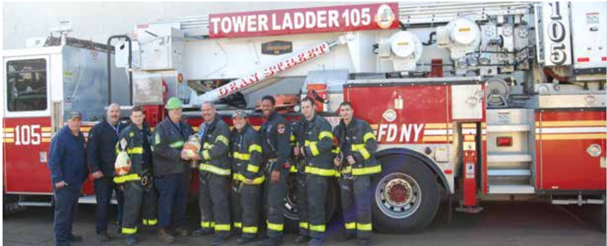
FDNY's Tower Ladder 105 of Dean Street.

Last November, in celebration of Thanksgiving, Gershow's Brooklyn location purchased turkeys to donate as a community service. First responders then distributed the turkeys to local families in need. Pictured below are the police and fire department units that participated.