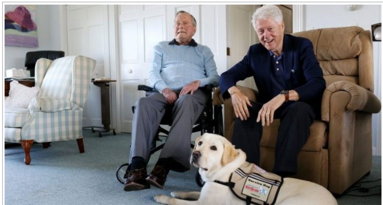
America's VetDogs of Smithtown recently placed a service dog with President George H.W. Bush (left), who with his dog, Sully, and President Bill Clinton.